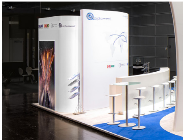
Aluminium 2016 (11 x 7 m)