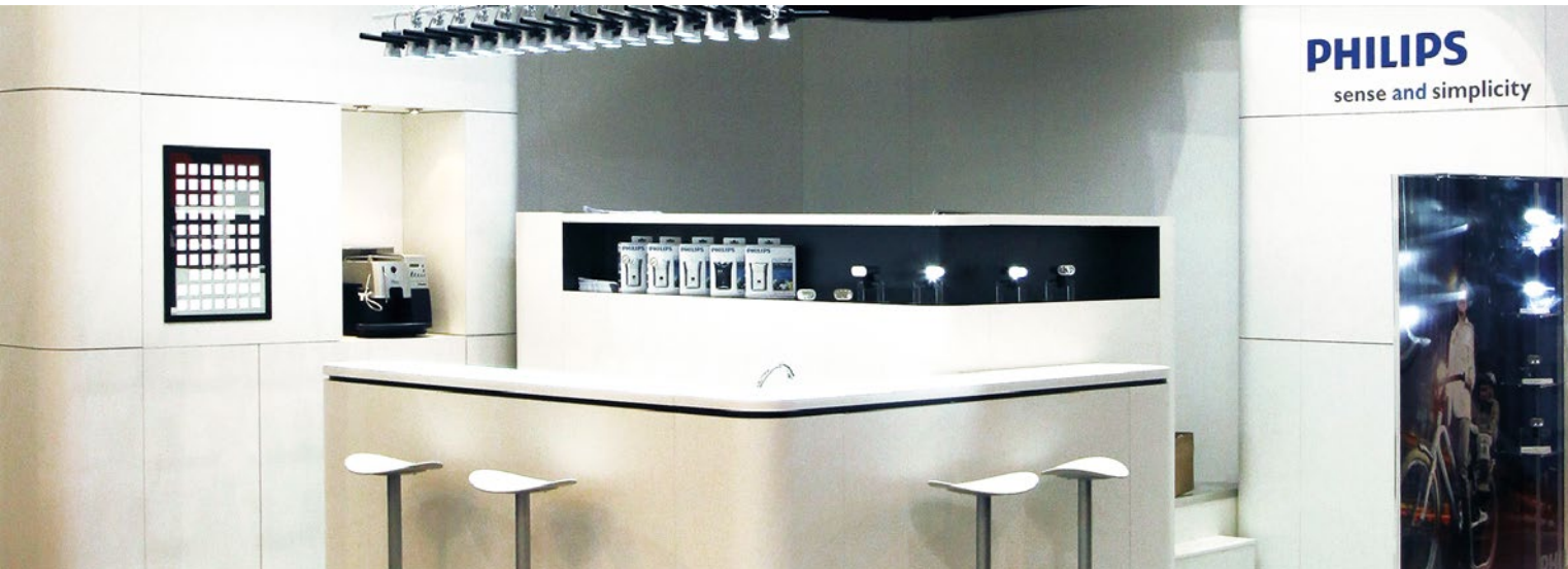
Eurobike 2010 (5 x 5 m)