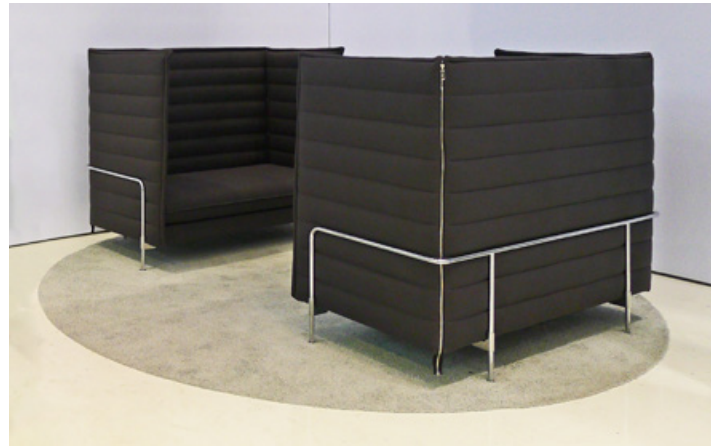
Tube 2018 (9 x 5 m)