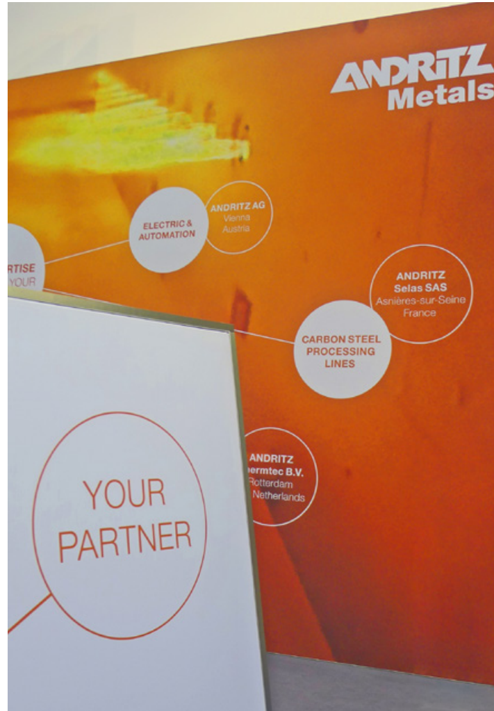
Thermprocess 2015 (12 x 12 m)